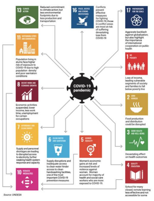
Figure 4: COVID-19 patterns of impact in relation to the sustainable development goals

Intergovernmental collaboration – water supply