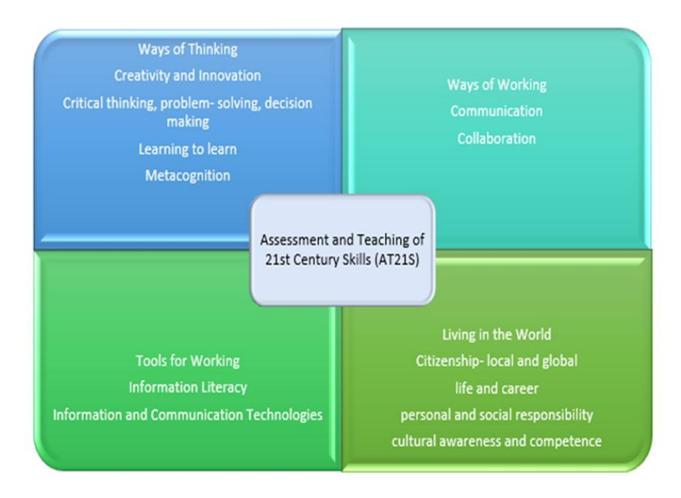
Figure 1: Assessment and Teaching of 21st Century Skills

One useful framework for conceptualizing 21st century skills is the Assessment and Teaching of 21st Century Skills (ATC21S) framework that originates from collaborative research headed by the University of Melbourne and separates skills into four compartments: Ways of Thinking; Ways of Working; Tools for Working; and Ways for Living in the World (GPE, 2020).