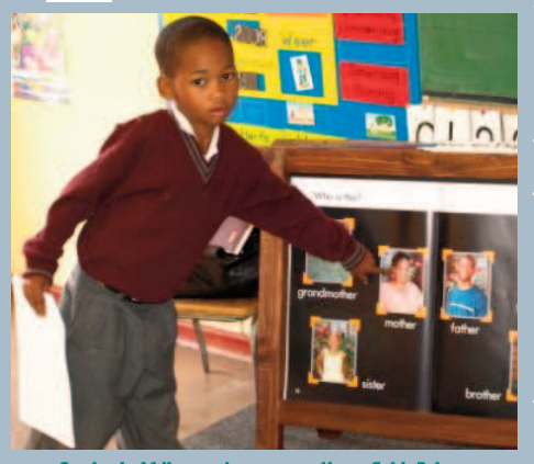
Grade I Afrikaans learner at Nancefield Primary learning the English terms for his family with the aid of a READ Big Book