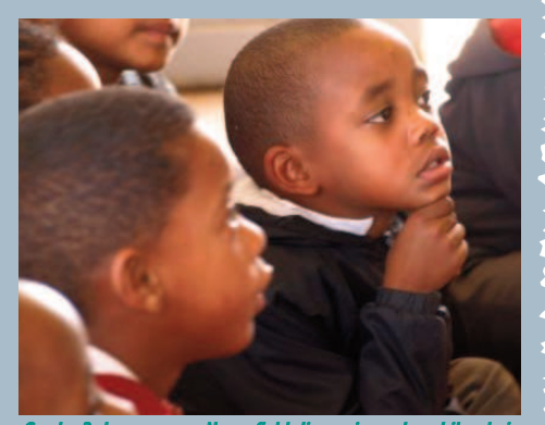
Grade 2 learners at Nancefield listen intently while their teacher tells a READ story