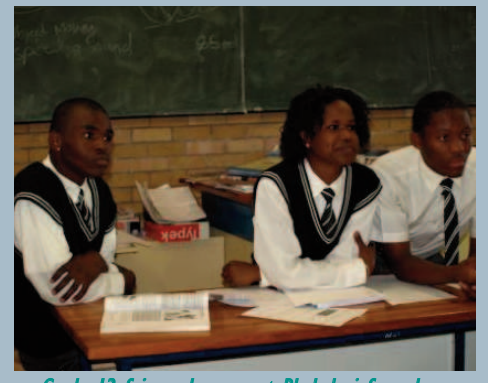
Grade 12 Science learners at Bhukulani Secondary, Soweto