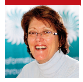
Zenex Gauteng Schools of Excellence